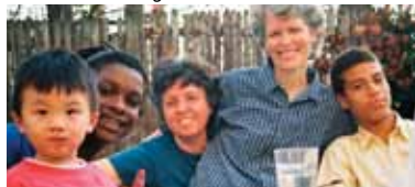
Off and Running