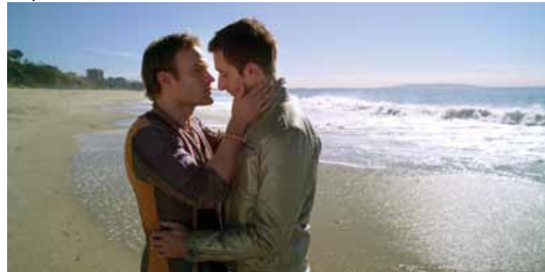
Hollywood Je T'Aime