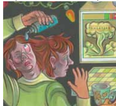
Every Time I See Your Picture I Cry