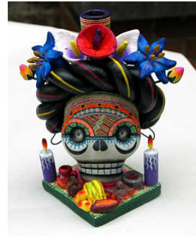
Día de los Muertos Day of the Dead Altars Website