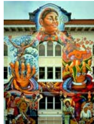
Rigoberta Menchú Mural