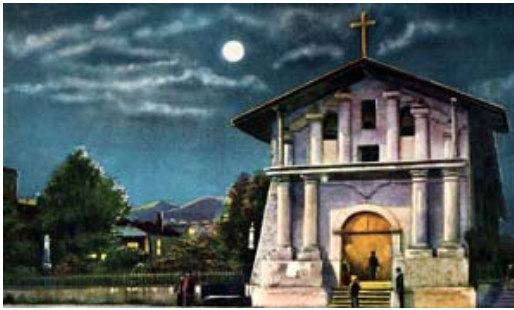
Mission District of San Francisco Mission Dolores Website

Mission Basilica San Francisco de Asís, also known as Mission Dolores, was founded on October 9, 1776. It was the sixth California mission, founded by Father Francisco Palou. It is located in San Francisco, and received the name Mission Dolores from the Arroyo de los Dolores , a nearby stream. It was named for St. Francis of Assisi, the founder of the Franciscan Order. The buildings have remained relatively unchanged since their construction in 1782.