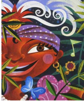
Illustration Rafael López Text Page 3