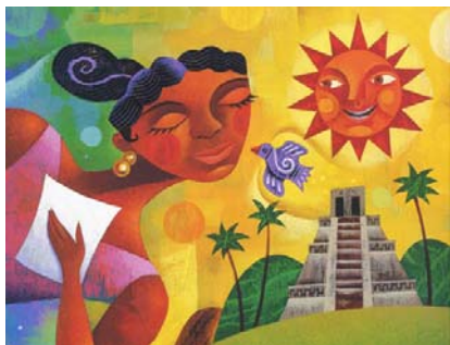
Text Page 14

I was still a young woman when a revolution began in my country. Like many others, I left my Cuba forever. First I traveled to Mexico.