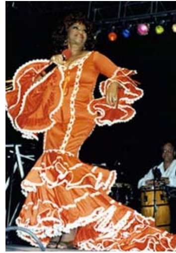
Celia Cruz Bata Dress