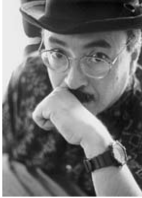
Juan Felipe Herrera

Author Page Curbstone Press Website 2001