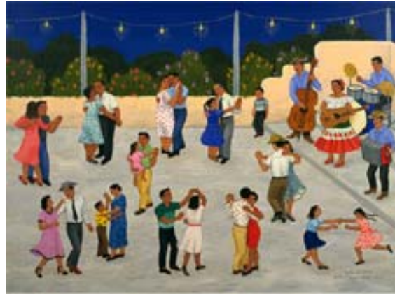
Baile En El Jardín-Dance at El Jardín Cover Illustration Carmen Lomas Garza