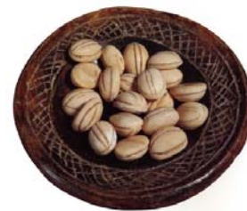
Cacao Beans The Courty Art of the Maya Children's Guide National Gallery of Art

According to the Popol Vuh, the Maya creation myth that was written down in the sixteenth century, maize and cacao were both discovered when the god K'awiil hurled a lightning bolt at a mountain, breaking it in two and revealing the two plants growing inside. Cacao and maize are therefore closely linked in Maya mythology.