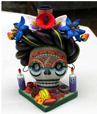
Skull from the Day of the Dead http://www.azcentral.com/ent/dead/altar/

A Piñata You Can Make: http://www.bry-backmanor.org/holidayfun/pinata.html