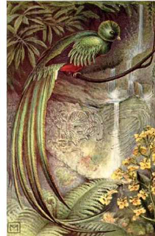
Illustration Page 26