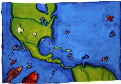
Illustration Page 2