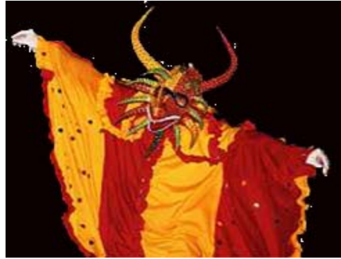
Vejigante Masquerader El Boricua

Divide students into small groups. Work with each group to find out more about the history of Vejigante masks [See Resources section for helpful Internet websites]. Finally, guide students to make their own Vejigante masks out of papier-mâché or make drawings of masks, use the coloring book illustration of Jaguar costumed figure, or make finger puppets of masked figures. (Excellent pictures can be found in books listed in the Resources)