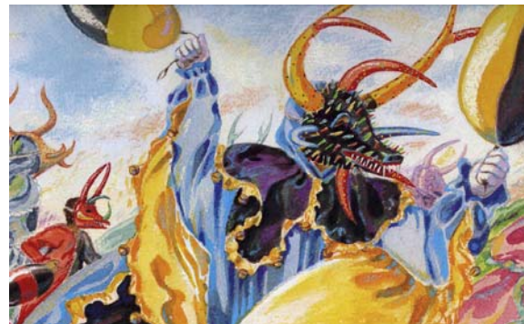
Vejigante Masquerader Lulu Delacre 1993 Illustration Page 23

The book and video set The Vejigante and the Folk Festivals of Puerto Rico tells the legend of the Vejigante and how he still appears today in carnival celebrations in three cities in Puerto Rico. The book gives insight into the differences in style and symbolism in these three festivals and is illustrated with beautiful drawings to color. The video The Legend of the Vejigante contains actual footage of the carnival celebrations plus detailed instructions on making the papier-mâché mask the Ponce Vejigante wears.