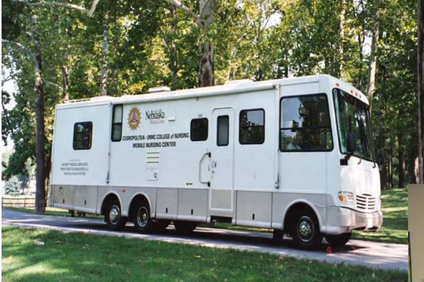
Morehead Center for Nursing Practice College of Nursing Nebraska Medical Center

UIC Integrated Health Care , established in 1998, provides integrated physical and mental health services to individuals with severe and persistent mental illness, via 4 nurse-managed clinics. Services are provided by UIC faculty family nurse practitioners and mental health clinical nurse specialists.