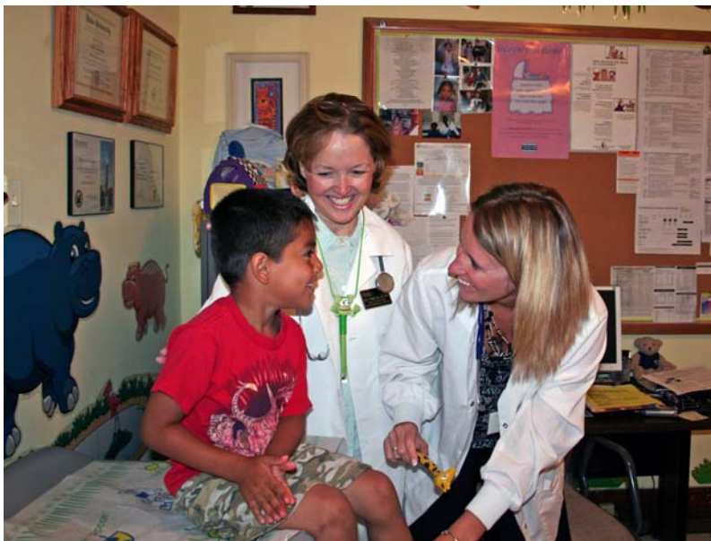
Purdue University's Trinity Nursing Center for Infant and Child Health, opened in April 2006, provides health and developmental assessment for children ages birth to 18 years.